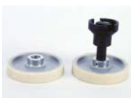
Heavy duty Contact Adaptors-