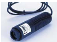
Remote Optical Sensor

rpm • Linear speed Metres & Feet per min (Metres/sec Metric Model) • Count mode - length & revs • Time interval (reciprical speed) • Time accumulative (average rate)